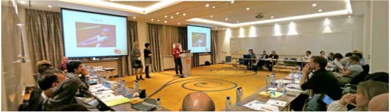
EPOA 2011 AGM, Brussels, Belgium