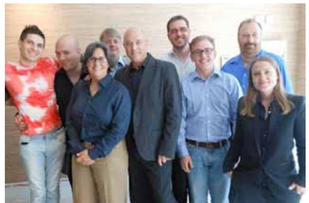
Members of the InterPride and EPOA boards at the joint member reception during WorldPride in London.

I have represented EPOA at Zürich Pride and at WorldPride in London. In addition to this attending the EPOA board meetings I have meet our member organisations in London and Riga.